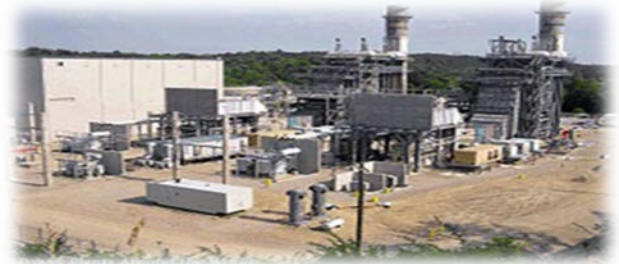
AEP Dresden NGCC